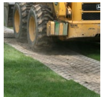
Ground Protection Matting