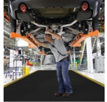
Industrial Safety Matting