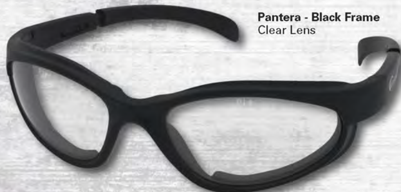
Pantera - Black Frame Clear Lens